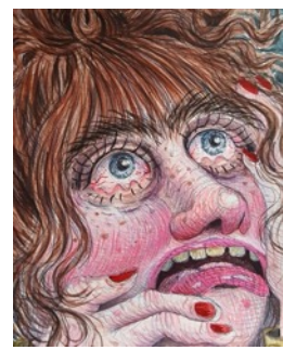
Horrified Self-Portrait 2016 ink and watercolor on paper 8 x 5 inches $900