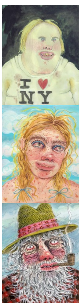
Untitled (I Heart NY), 2011 ink and gouache on paper 11 x 8.5 inches $900