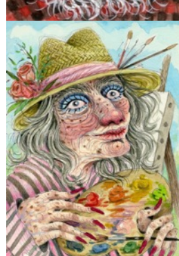
Sunday Painter, 2016 ink and watercolor on paper 7 x 5 inches $1,000