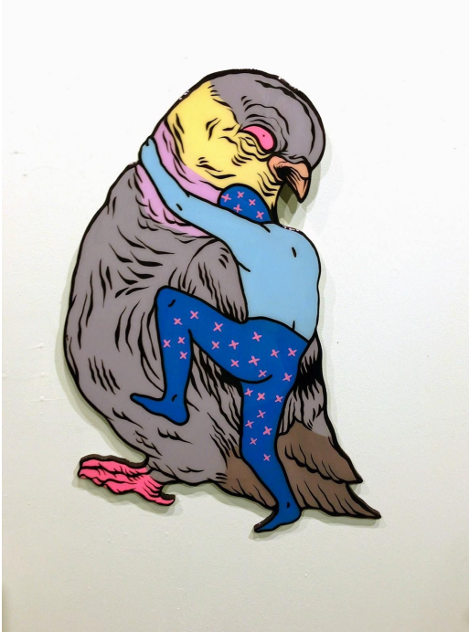
Luchador vs. Pigeon