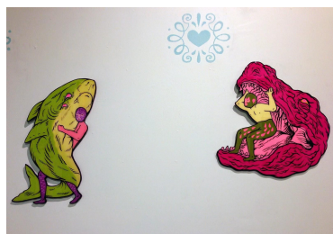
Battle with a shark and an alligator