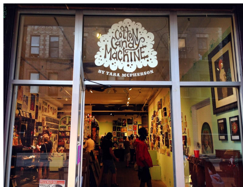
Candy Machine in Brooklyn, There are 2 exhibitions showing right now--the Trifecta and Boy Kong's Lucha No Libre

A 3D artist by trade, Boy Kong brilliantly illustrates, paints and then hand cuts + layers pieces of wood or acrylic to create his signature aesthetic. His pieces usually incorporate a bright and upbeat color scheme while his subjects often portray a bleak (and sometimes gory) message. Boy Kong's newest exhibit, Lucha No Libre puts a spin on the traditional Lucha Libre, a style of amateur freestyle wrestling; the masked luchadores (wrestlers) take on fierce beasts drenched in affable colors such as pale pink, periwinkle and lemon.