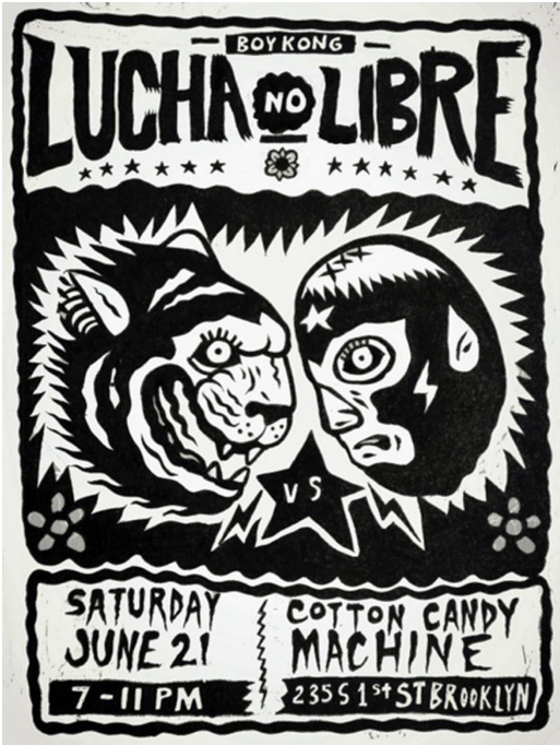
Invite for Boy Kong's opening exhibit at Cotton Candy Machine in Brooklyn Cotton