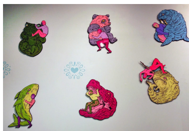
Closer look at 6 pieces